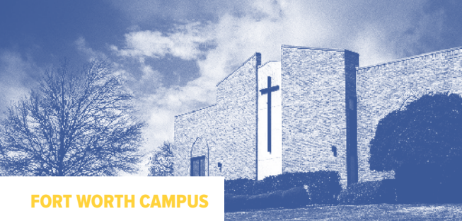
FORT WORTH CAMPUS