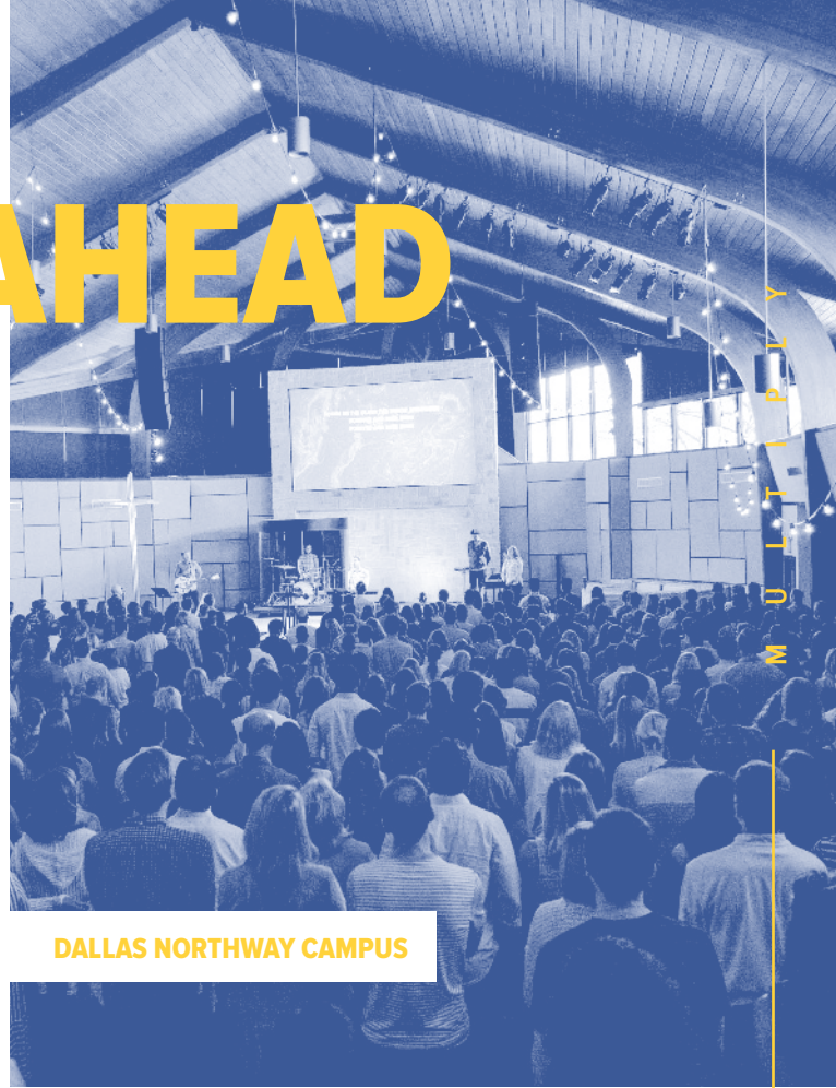
DALLAS NORTHWAY CAMPUS

"Stepping into the Campus Pastor role, my family and I have been blown away by encouragement from the staff and Covenant Members. Not a day has gone by where I haven't thanked the Lord for bringing me here to lock arms with this church family and watch them respond well to so much transition. They helped send out two significant church plants, Eastside & Mosaic, many taking courageous steps to pray, send or go with these plants. We also had several staff roll off with these plants, which created opportunities for remaining staff to step into gaps and lead in new and creative