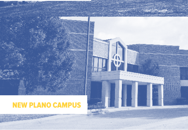
NEW PLANO CAMPUS